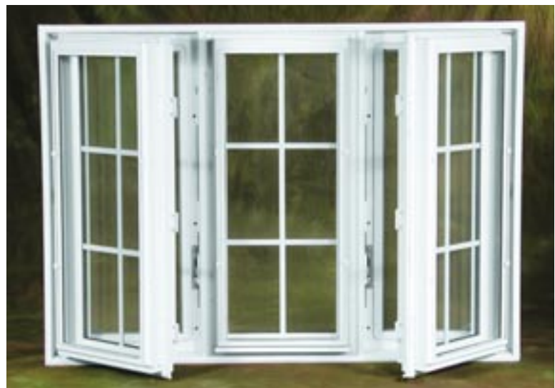
Three-Light Casement Window