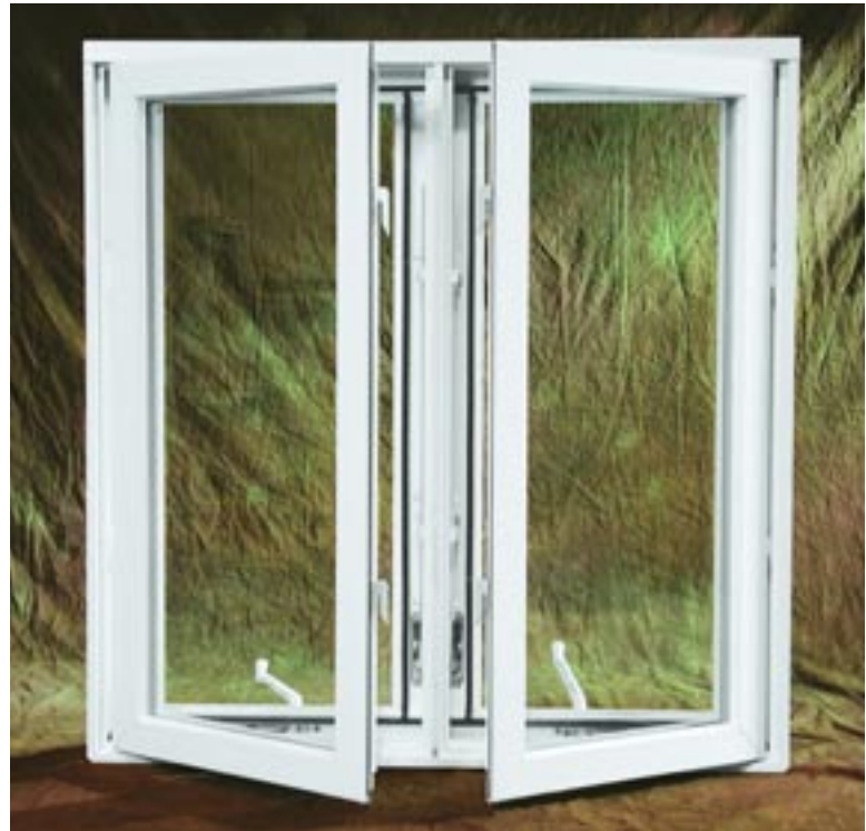
Two-Light Casement Window