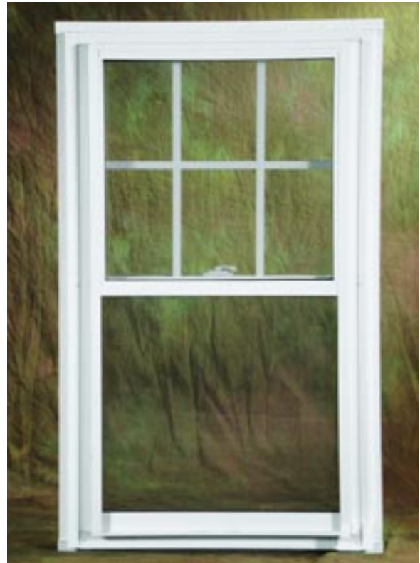
Colonial (Top Sash Shown)