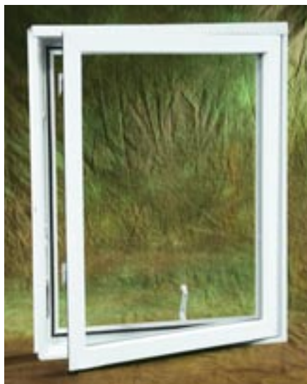
Single Casement Window